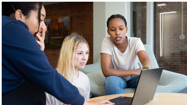
Fannie Barrier Williams Scholars at SUNY Brockport

ESL provided a $1.1 million grant to the Brockport Foundation to fund the Fannie Barrier Williams Scholars program. The program offers four-year scholarships to 30 high-potential students from low-income families in Monroe, Orleans, Genesee, Livingston, Ontario and Wayne counties. Eligible students include accepted incoming freshman students enrolled in a degree program at the college and identified as low-income and not receiving a traditional merit/academic scholarship from the institution. These students also should be considered most at risk of not persisting to graduation. Priority is given to students of color. Named after the first woman of color to graduate from the Brockport Normal & Training School (SUNY Brockport’s predecessor) in 1870, Williams was a public speaker and reform and labor activist who kept company with other prominent leaders, such as Booker T. Washington, Susan B. Anthony, Elizabeth Cady Stanton, Mary Church Terrell, Ida B. Wells and Frederick Douglass.